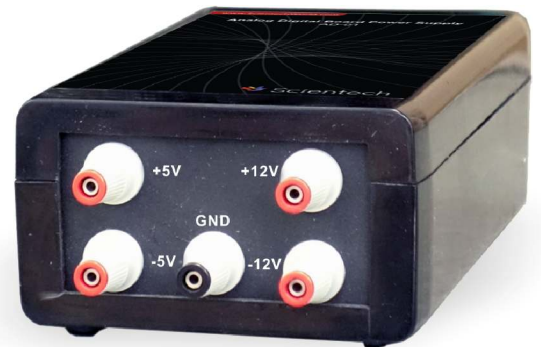
AD-01 DC Power Supply (optional)

Scientech AB106 FM Modulator & Demodulator is a compact, ready to use experiment board for FM Modulator & Demodulator. This board is useful for students to study and understand the functionality of Reactance modulator and Foster Seeley/ Ratio detector.