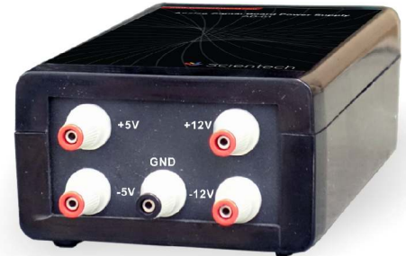
AD-01 DC Power Supply (optional)

Scientech AB51 Active Filters (Low Pass and High Pass) is a compact ready to use experiment board for Active Low Pass and High Pass filters of and to evaluate cutoff frequencies, pass band gains and frequency response.