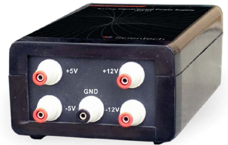
AD-01 DC Power Supply (optional)

Scientech AB56 Fiber Optics Analog Link is a compact, ready to use experiment board for Fiber Optics Analog Link. This board is useful for students to study and understand operation of fiber optics analog link and its properties.