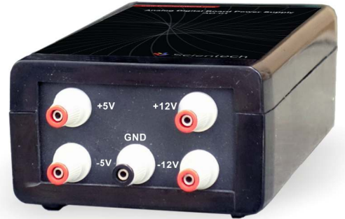
AD-01 DC Power Supply (optional)

Scientech AB59 Maxwell's Inductance Bridge is a compact, ready to use experiment board for Maxwell's inductance bridge. This board is useful for students to study and understand operation of Maxwell's inductance bridge and to determine the value of unknown inductance by comparing the branch impedance of the bridge.