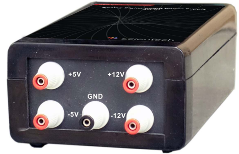
AD-01 DC Power Supply (optional)

Scientech AB65 Phase Shift Oscillator is a compact, ready to use Phase Shift Oscillator experiment board. This board is useful for students to study and understand operation of phase shift oscillator and to observe the phase shift introduced by different RC stages of a phase shift oscillator.