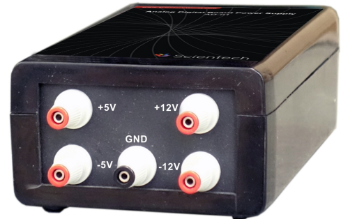
AD-01 DC Power Supply (optional)

Scientech AB67 Colpitt's Oscillator is a compact, ready to use Colpitt's Oscillator experiment board. This board is useful for students to study and understand operation of Colpitt's oscillator and measure the resonance frequency of oscillations for different combination of capacitors.