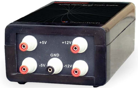
AD-01 DC Power Supply (optional)

Scientech AB68 Hartley Oscillator is a compact, ready to use Hartley Oscillator experiment board. This board is useful for students to study and understand operation of Hartley oscillator, and measure the resonance frequency of the oscillator for different combination of inductors.