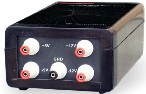
AD-01 DC Power Supply (optional)

Scientech AB91 Optical Transducer is a compact, ready to use experiment board for Optical transducer (Photovoltaic cell). This board is useful for students to study and understand the operation of Photovoltaic Cell as an optical transducer and to plot the characteristics of it.